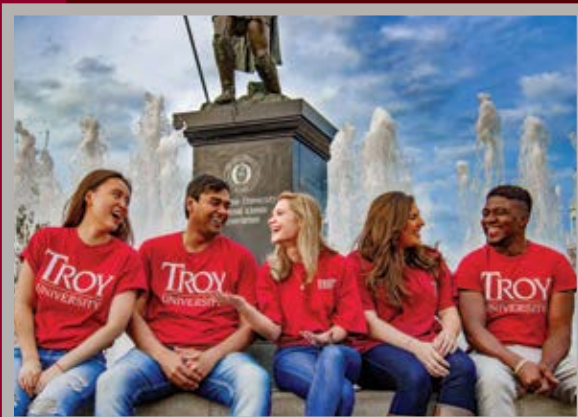
Students from around the globe receive top-notch educations and form lasting relationships at Troy University.

Please let us know what you think of this letter to parents and if there are specific issues you would like to see addressed in an upcoming letter. Please send all comments to officeofthechancellor@troy.edu .